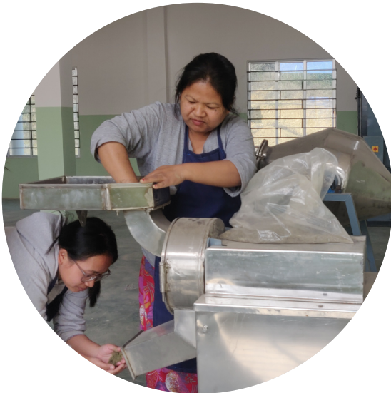
Learning to process lemon grass in grinding machine. Other products include essential oils, fragrance cones.