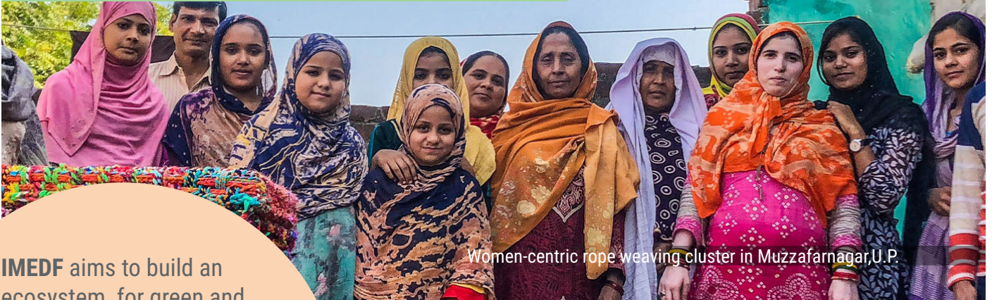
Women-centric rope weaving cluster in Muzzafarnagar, U.P.

IMEDF aims to build an ecosystem for green and inclusive entrepreneurship. It is a nodal agency of Ministry of Micro, Small & Medium Enterprises, Government of India for development of clusters under SFURTI (Scheme of Fund for Regeneration of Traditional Industries)