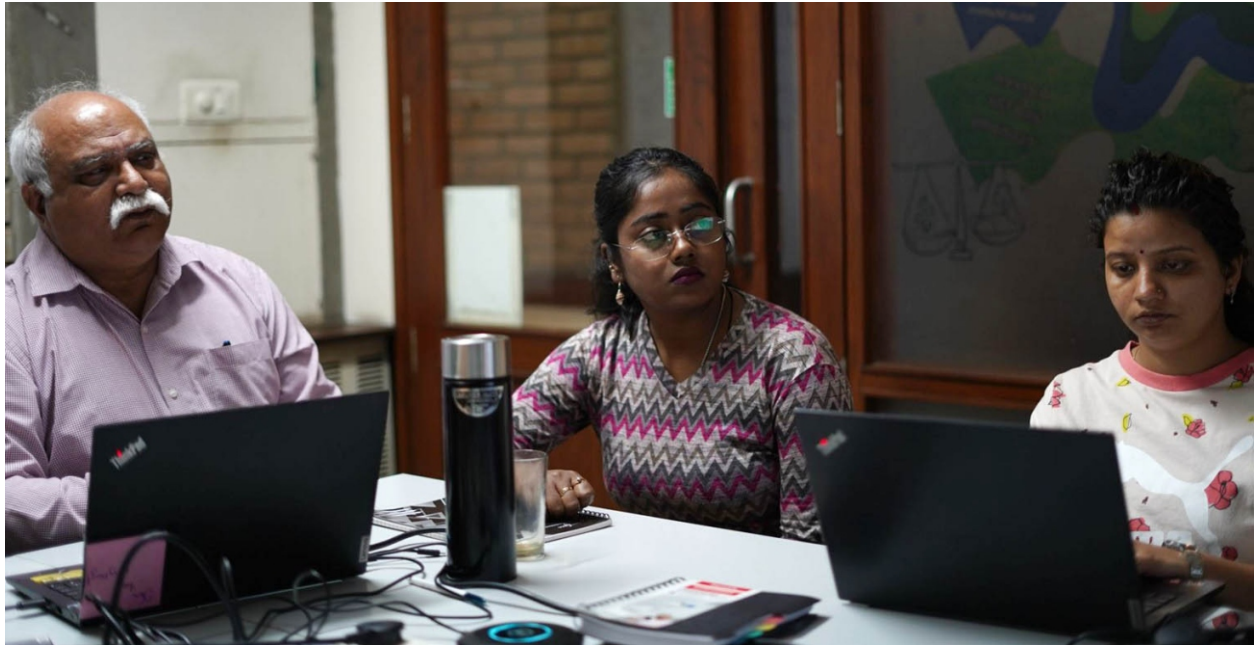
Glimpse from the workshop