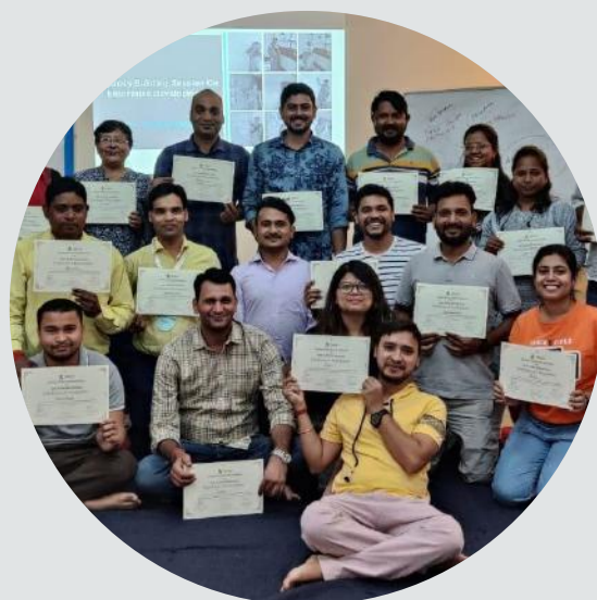
Participants from PRADAN, Manjari Foundation, Chaitanya Foundation, and PRAN with the certificates

There were 25 participants, including executives from five States - Jharkhand, Chhattisgarh, Odisha, Bihar and Maharashtra. The session covered inclusive entrepreneurship business models, and Social Innovation tools for holistic enterprise development. The trainees engaged in various group activities, such as a Comic Workshop moderated by the trainers.