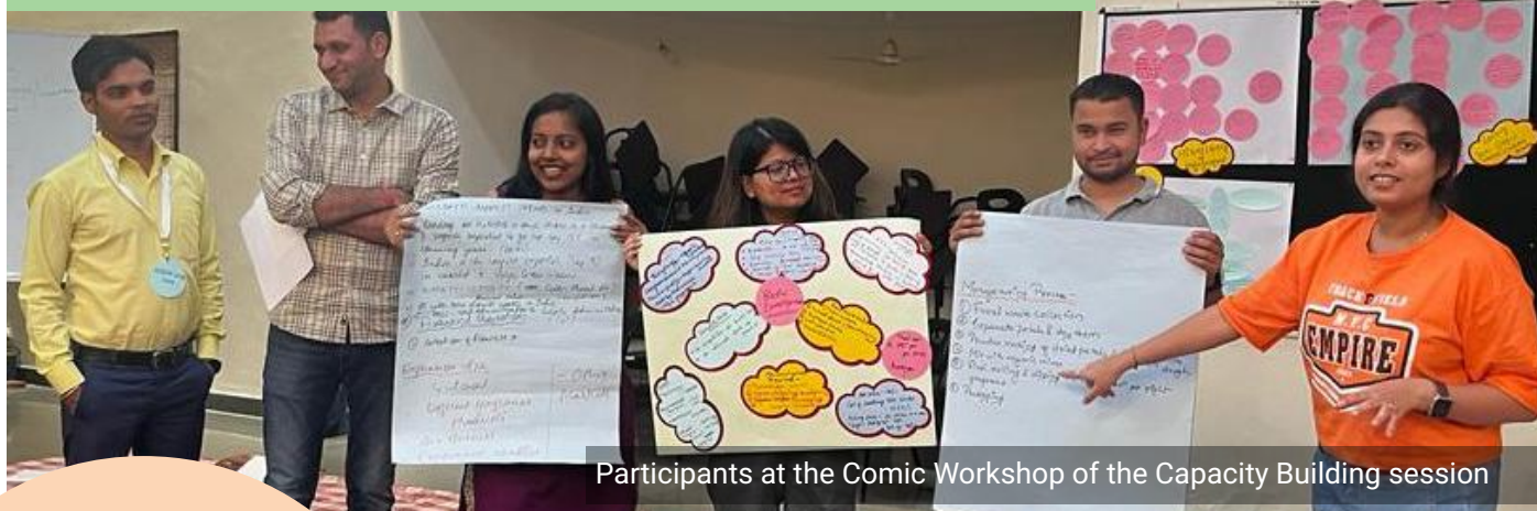
Participants at the Comic Workshop of the Capacity Building session

IMEDF is a social enterprise vehicle of the Development Alternatives Group. Its major lines of business are cluster development, micro enterprise development and capacity building.