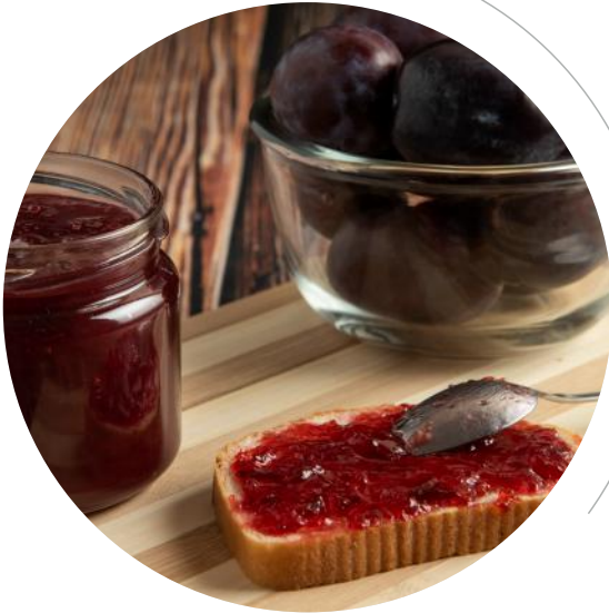
Jamun (Java Plum or Indian Blackberry), one of the ten NTFPs to be developed into value-added products