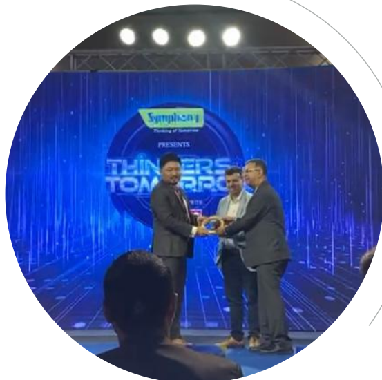
Two awards were conferred to the cluster - Retail & Commerce, and The Most Promising MSME

A Catalogue of 50+ products has been launched for Rural Industrial Parks (RIPAs) in Bilaspur district of Chhattisgarh. RIPAs are an initiative of Government of Chhattisgarh where IMEDF is providing technical support on branding, marketing, and capacity building in 08 blocks. The products range from fly ash bricks, bamboo crafts, cattle feed, dairy, mushroom, bakery, spices, garments, and detergents.