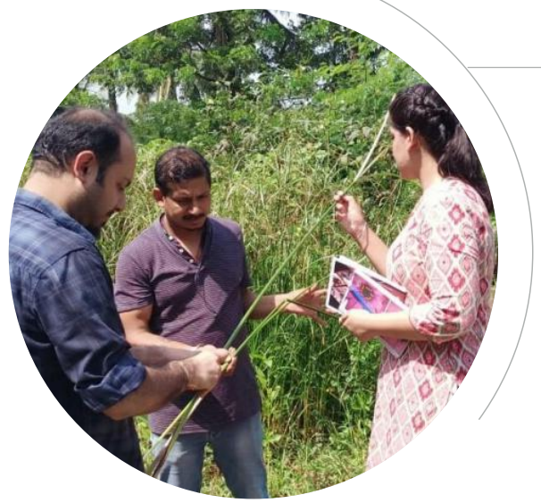
The Assessment team at Matcraft Cluster, West Bengal