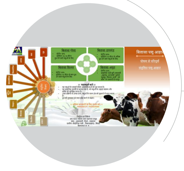
The cattle feed brand Bilasa Pashu Aahar