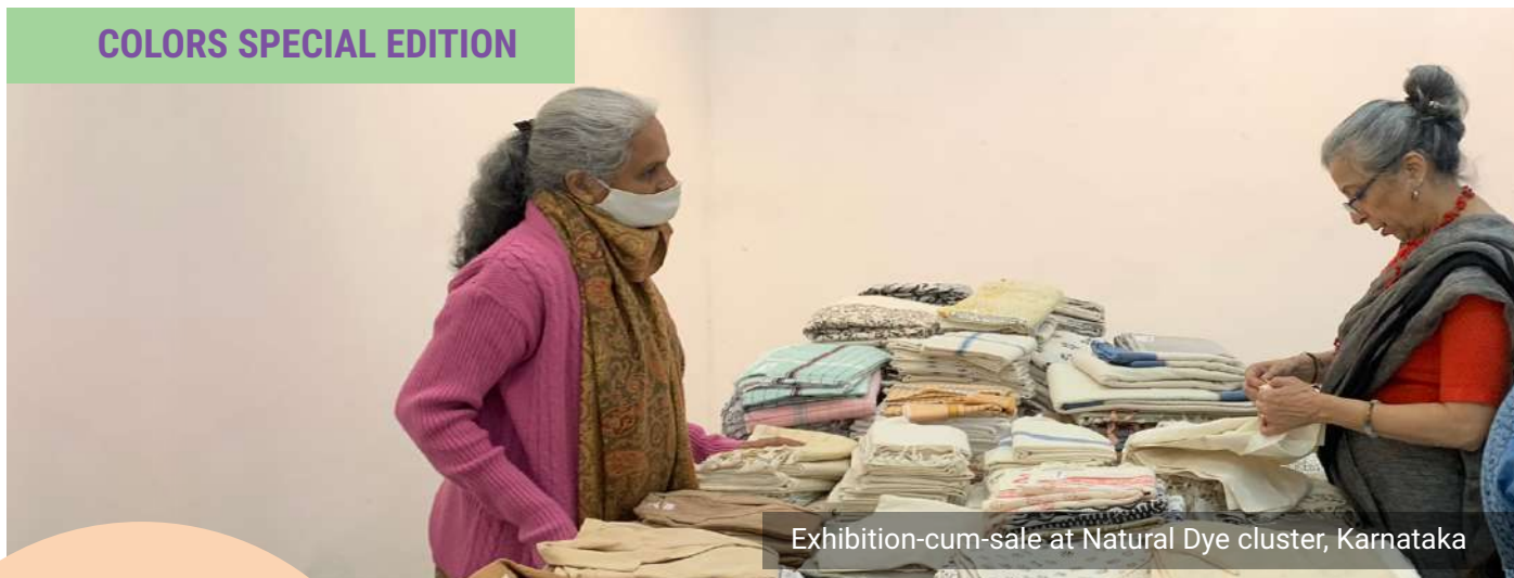
Exhibition-cum-sale at Natural Dye cluster, Karnataka

IMEDF is a social enterprise vehicle of the Development Alternatives Group. Its major lines of business are cluster development, enterprise support services, and capacity building.