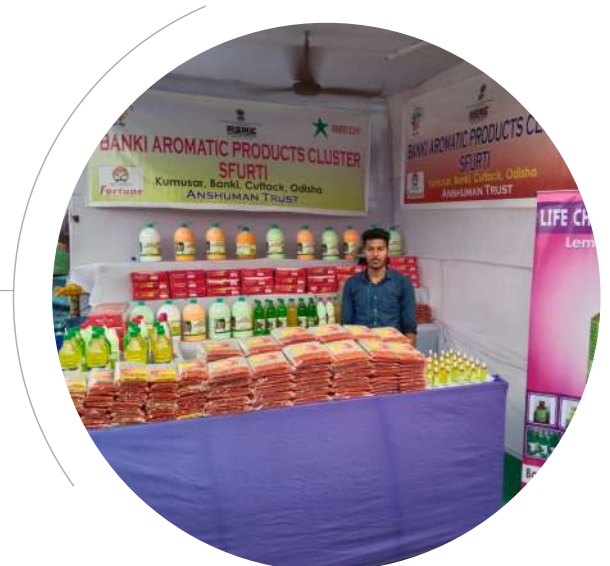
Banki Aromatic Products stall at the exhibition

Banki Aromatic Products Cluster, Odisha participated at the Barabati Shishira Mela held at Cuttack from February 19 to 28, 2023. They exhibited handcrafted products of lemongrass essential oil, incense sticks, dish wash, car wash, and household cleaners under their brand name - Life Choice.