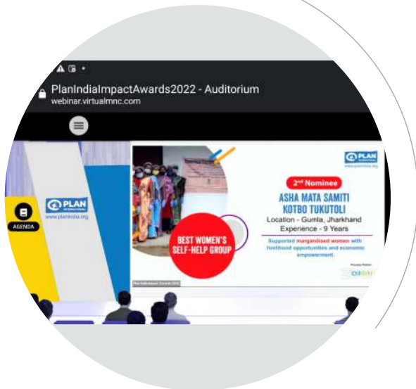
Asha Mata Samiti Self Help Group among Top 3 Best Women's SHG ceremony