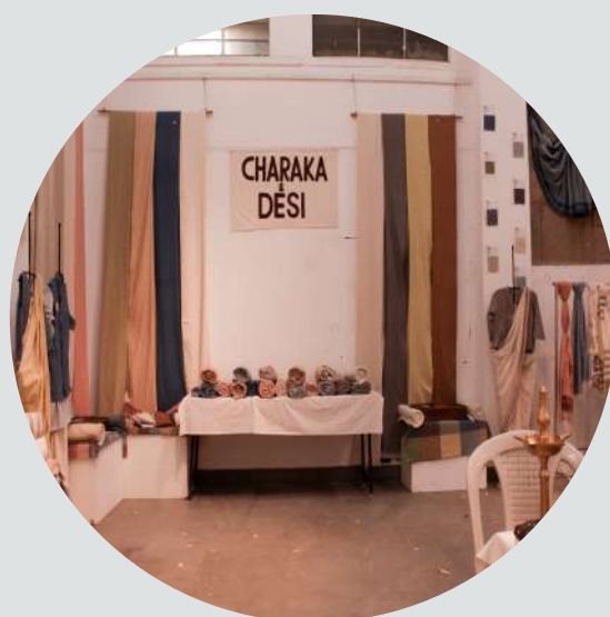
Exhibition of natural dye products

The cluster makes apparel wear for men and women along with accessories at the Common Facility Centre situated at Bhimanakone village on the Western Ghats of Southern India.