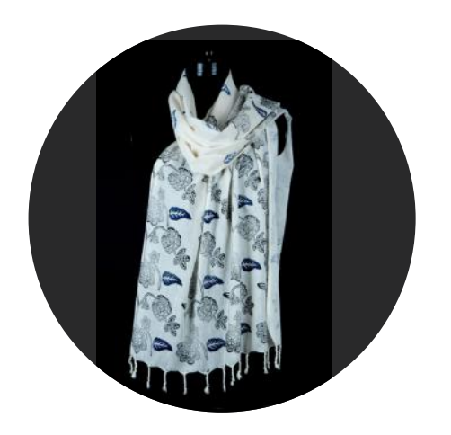
Indigo-dyed Stole made by the artisans