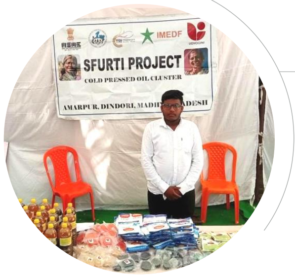
Cold Pressed Oil manufactured by women led Dindori cluster