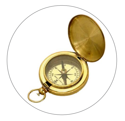
A compass made by the cluster artisans

Promoting environmentally conscious manufacturing