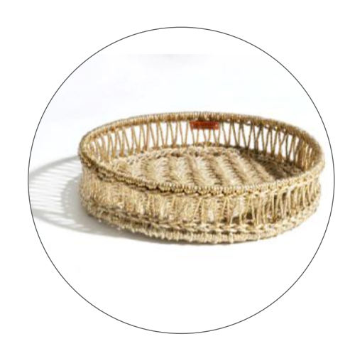
A gift basket made by the women artisans

The 311 women-only cluster makes exquisite utility products such as baskets with upcycled textile industry waste that are hugely loved by connoisseurs of art. The products are sold under the brand - SIROHI at www.sirohi.org